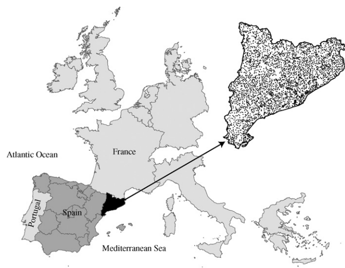
Fig. 1. Geographic location of the study area. Black dots in the enlarged map of Catalonia represent the 2923 UTM 1 km × 1 km cells considered in the study.

Forests represent about 38% of the total area of Catalonia, and about 80% are privately owned (Terradas et al., 2004).